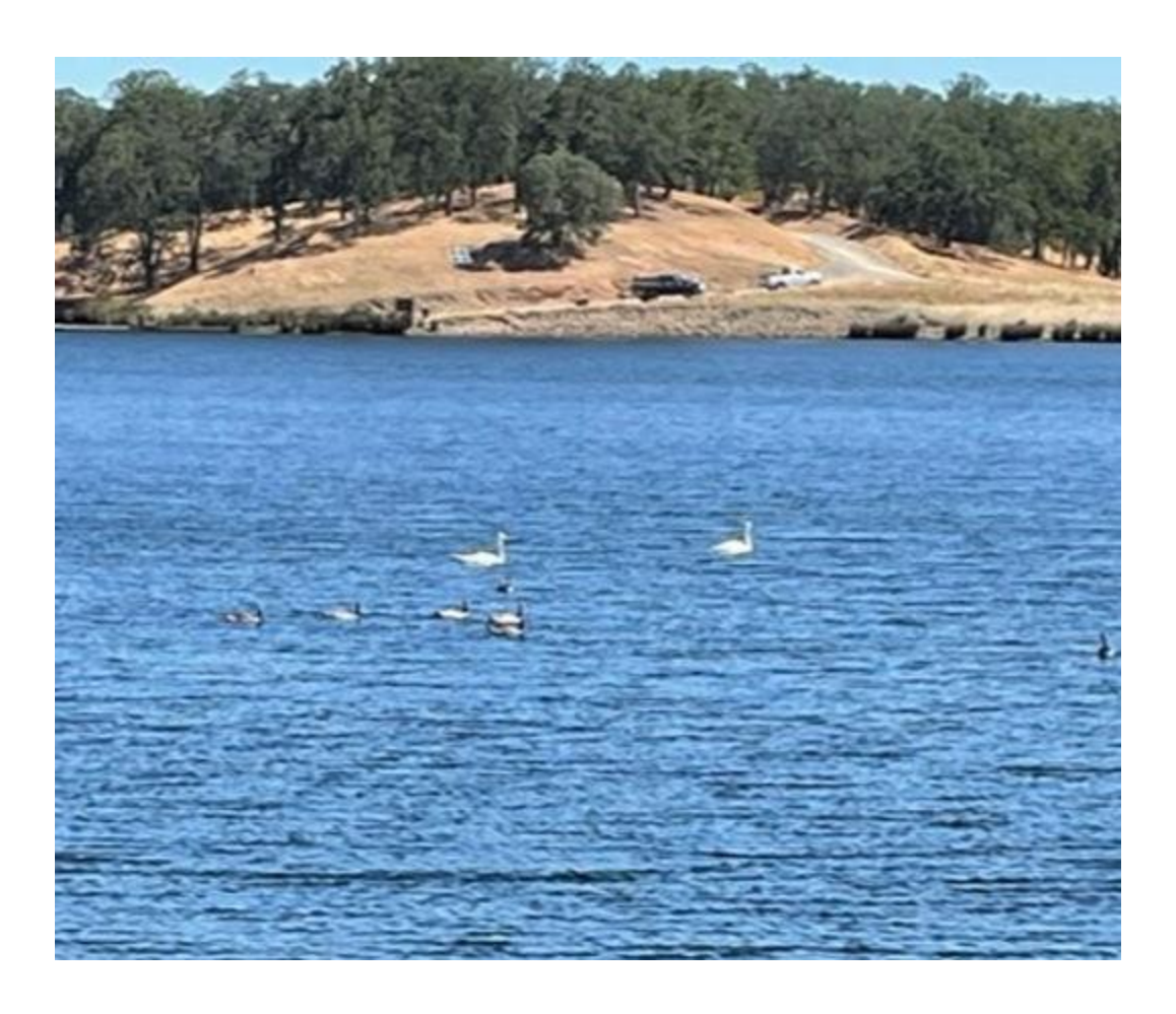
The T-shirts are in!

We are officially launching our T-Shirt & Hat Campaign July 1-August 30th. Please place your orders <a href="https://example.com/here">here</a> on the SOLOS Website.